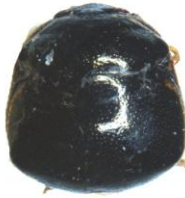
Captopsoma coniectum Montand