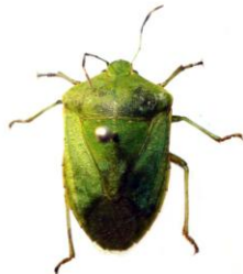
Nezara viridula , (Linnaeus)