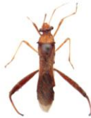
Riptortus pedestris (Fabricius)