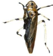
Bothrogonia ferruginea Fabricius