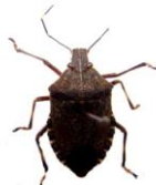
Apodiphus pilipes , Horváth