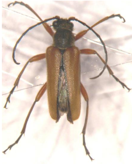
Figure 1. Cortodera rufipes (Kraatz, 1876) from Kahramanmaraş prov..