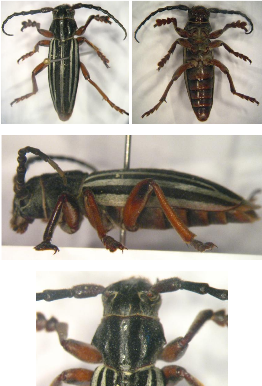
Figure 1. D. dombilicoides sp. n. (holotype ♂).