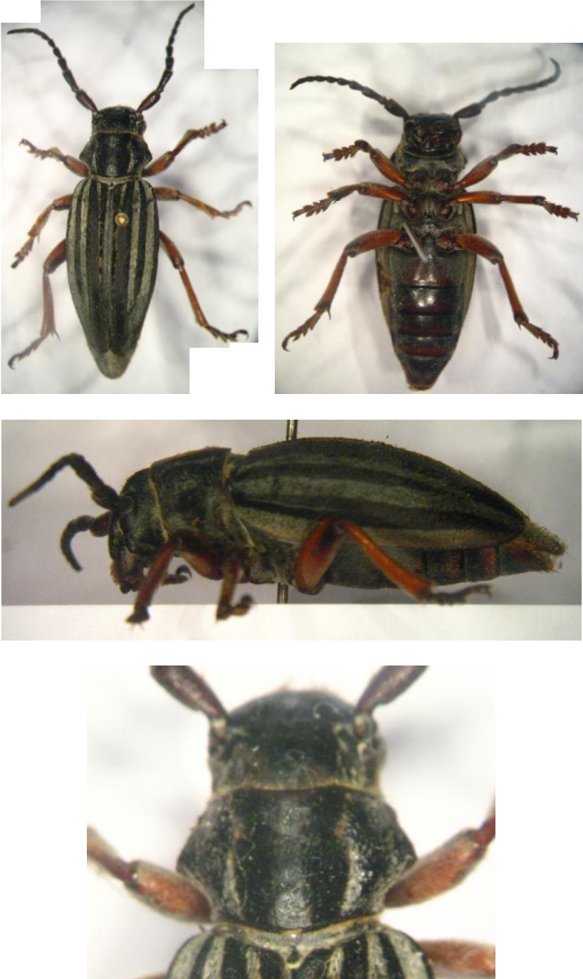
Figure 2. D. dombilicoides sp. n. (paratype ♀).