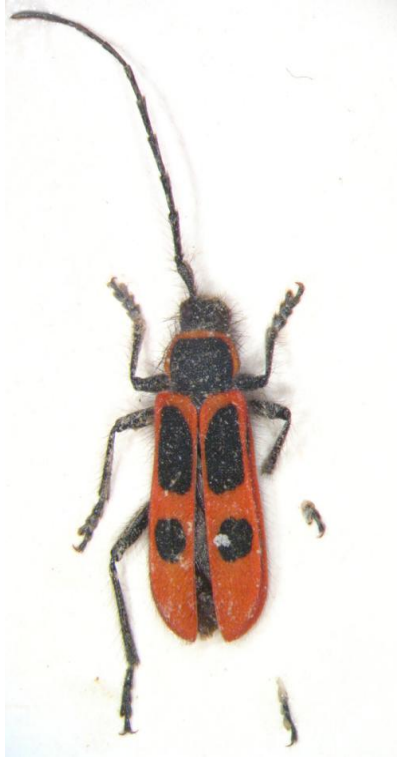
Figure 1. General habitus of Calchaenesthes primis Özdikmen sp. n. (Holotype).