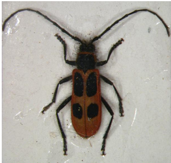
Figure 2. General habitus of Calchaenesthes primis Özdikmen sp. n. (Allotype).