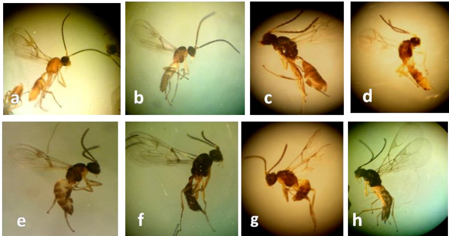
Figure 2. Female parasitoids: a- Aphidius matricariae Haliday, b- A transcaspicus Telenga, c- Binodoxys acalephae Marshall, d- B. angelicae Haliday, e- Diaeratiella rapae M'Intosh., f- Ephedrus persicae Froggatt, g- Lysiphlebus fabarum Marshall, h- Praon volucre Haliday.