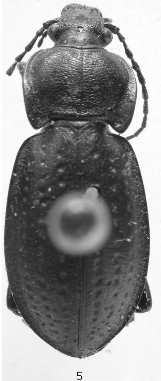
Fig. 5. Carabus sibiricus fossulatus (Holotype).