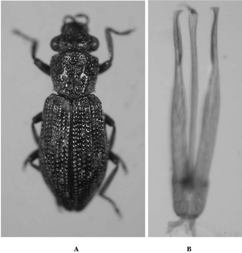
Fig. 2. H. nitidicollis . A) General appearance from dorsal side. B) Aedeagophore. Scale bar represents 0.3 mm.