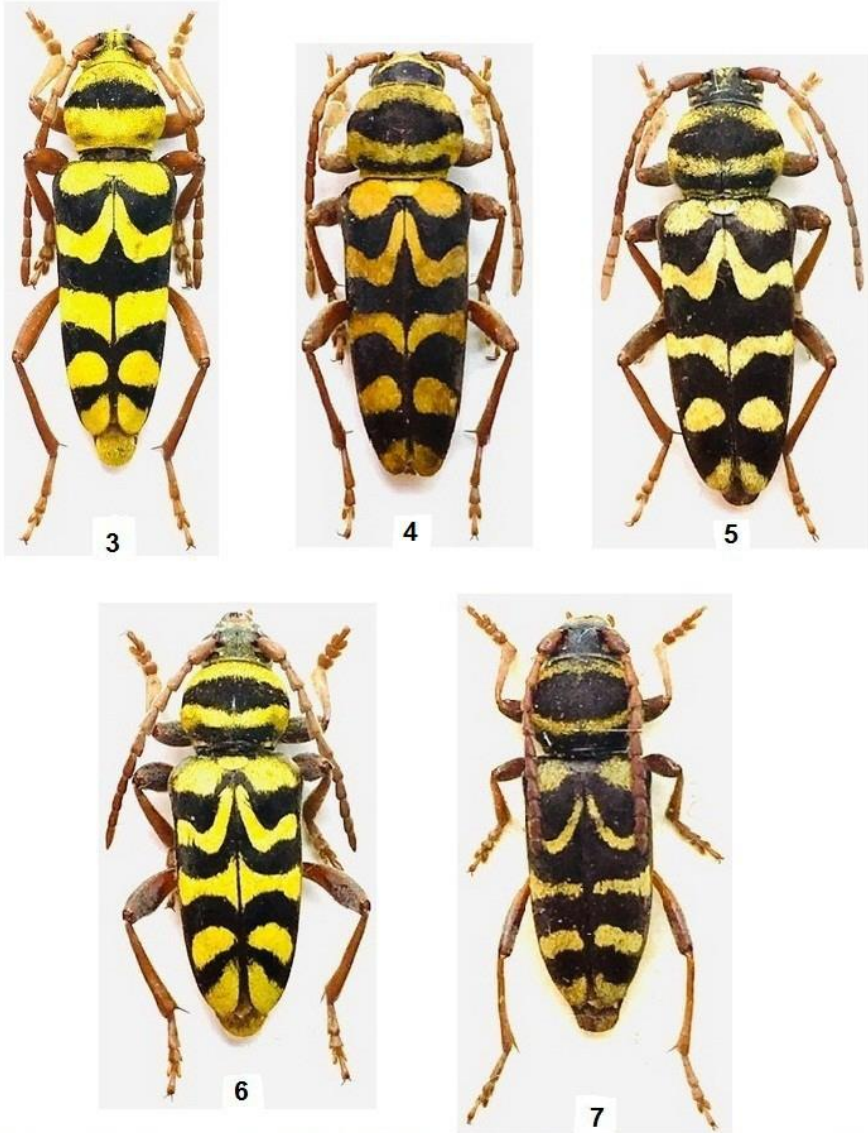
Figures 3-7. 3. Neoplacionotus bobelayei mouzafferi (Pic, 1905), 4. Neoplacionotus bobelayei huseyini Lazarev, 2016, 5. Neoplacionotus bobelayei bobelayei (Brullé, 1832), 6. Neoplacionotus andreui (Fuente, 1908), 7. Neoplacionotus scalaris (Brullé, 1832).