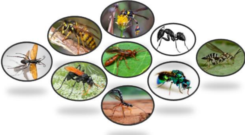
Figure 1. Hymenoptera species.