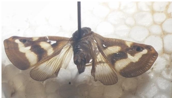
Figure 2. Adults of Ricania japonica .