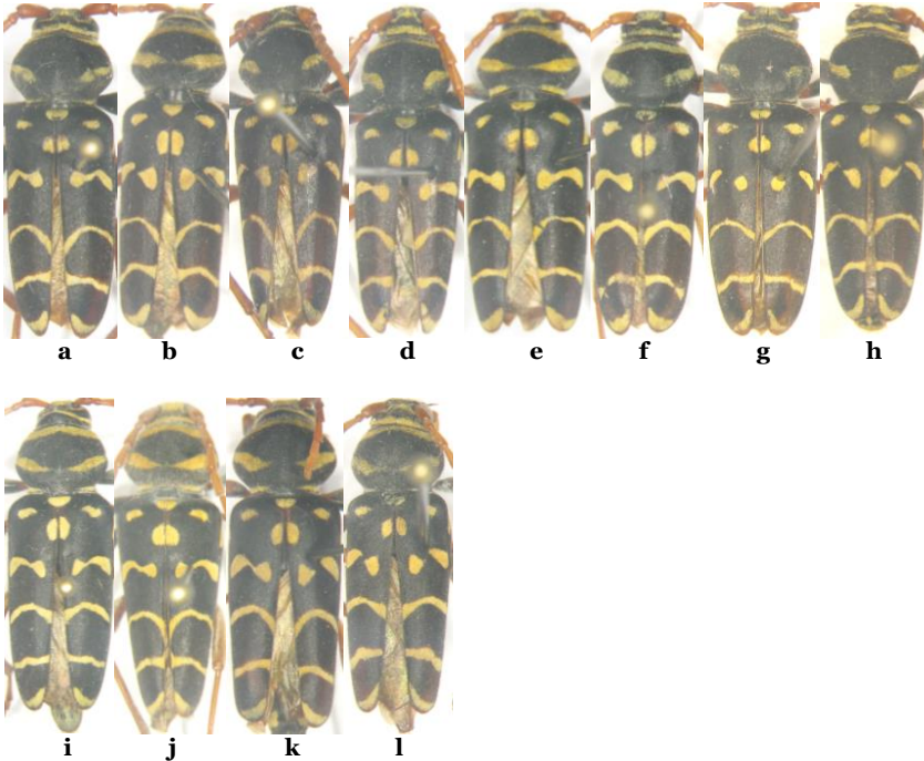
Figure 2. Variation patterns of Plagionotus arcuatus tastani ssp. nov., a. Holotype male from Gebze, b. Paratype female from Gebze, c. Paratype male from Gebze, d. Paratype male from Gebze, e. Paratype female from Gebze, f. Paratype female from Başiskele, g. Paratype male from Gebze, h. Paratype male from Gebze, i. Paratype female from Gebze, j. Paratype female from Gebze, k. Paratype female from Gebze, l. Paratype female from Gebze.