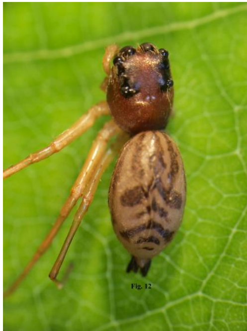
Figs. 11-12: Photographic images: 11. General habitus of Euophrys frontalis (Walckenaer); 12. General habitus of Euophrys omnisuperstes Wanless.