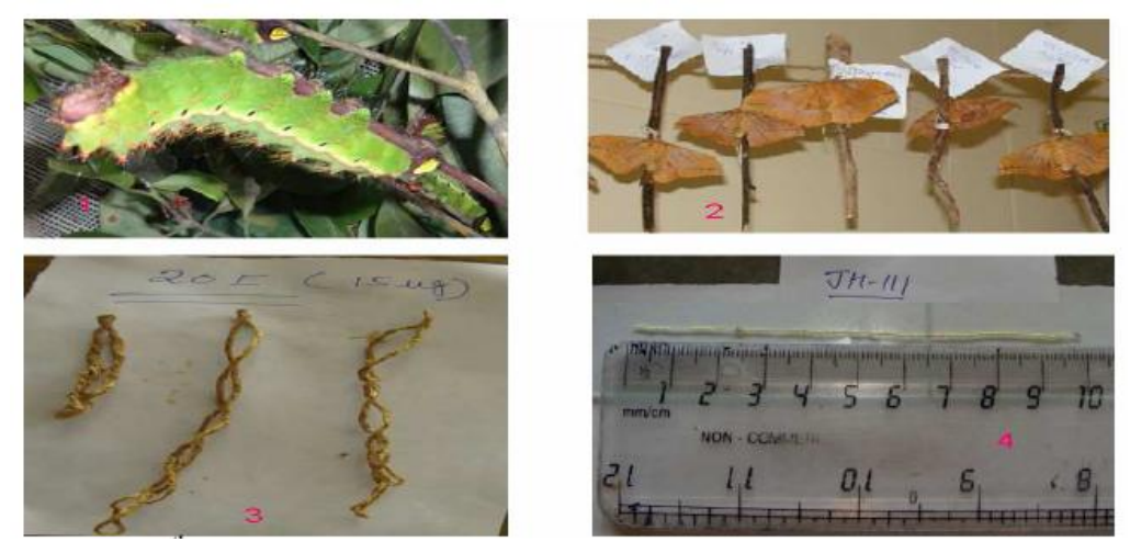
Figures 1. 5th inster larvae treated with 20E (15 \mu g) 2. Grainage activity of treated moths 3. Silk treated with 20E (15 \mu g) 4. Mesurment of ovary length with JH-III treatment.

Figures 1.Comparisons of fecundity, retain eggs and length of ovary 2. Comparisons of cocoon wt, pupal wt and shell wt 3. Comparisons of larval duration and cocoon formation 4. Comparisons of silk ratio and thickness of silk of treated and untreated muga silkworm. All the columns represent (averages \pm SE) of the mean.