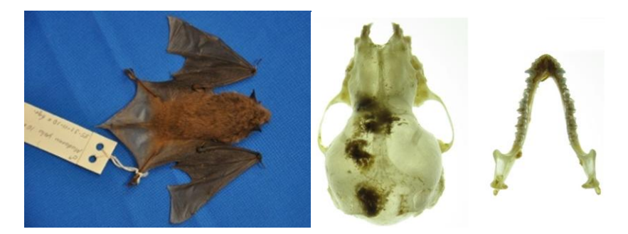
Figure 1. A museum material and head skeleton of Myotis daubentonii.

away from water resurces. Thus, water bat is specialized to feed on aquatic insects.