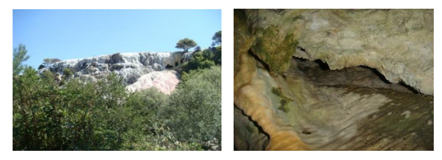
Figure 2. Habitat of M.daubentonii and its roost sites in a cave.