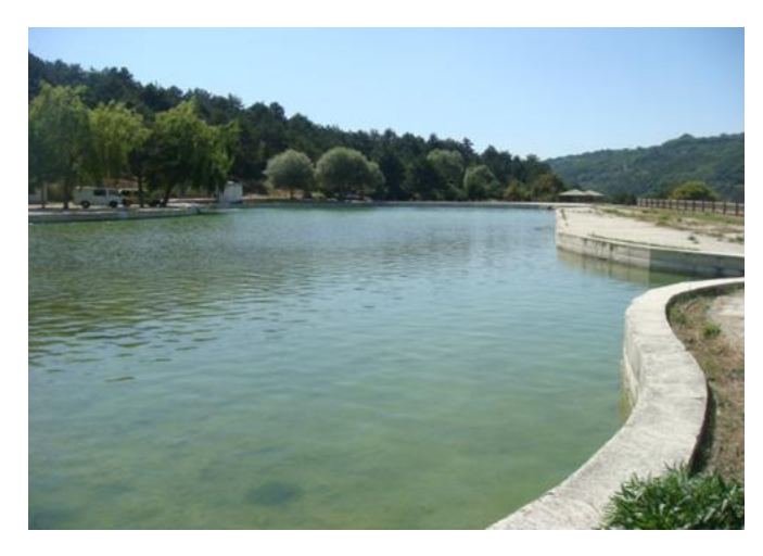
Figure 4. A pond on which the aquatic insects are occured in water bat habitat.

Table. Some external measurements and weights of M. daubentonii specimens from Bolu province (n: sample size, r: range, m: mean, sd: standart deviation).