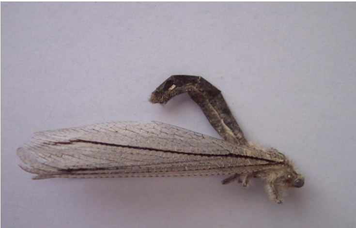
Figure 2. The adult of Acanthaclisis mesopotamica Hölzel, 1972.