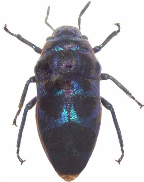
Figure 1. Brachyaulax cyaneovitta (Walker, 1867)