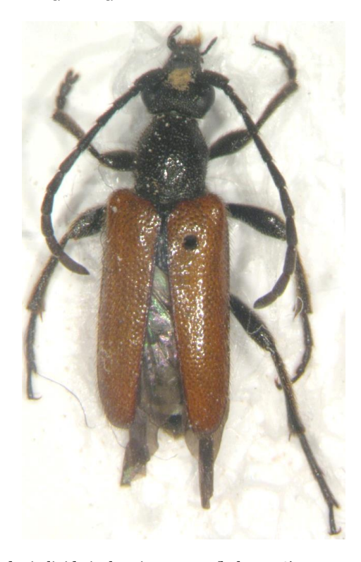
Figure 1. Pseudovadonia livida irakensis ssp. nov. (holotype ♀).

Özdikmen, H. 2015. A new subspecies of Pseudovadonia livida (Fabricius, 1777) from Turkey (Cerambycidae: Lepturinae). Munis Entomology & Zoology, 10: 319-321.