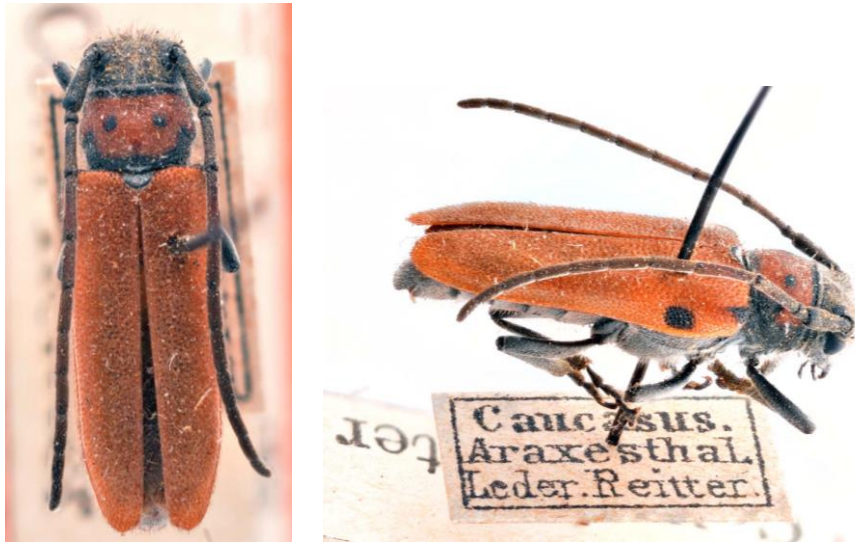
Figure 1. Phytoecia praetextata var. implagiata Reitter, 1898 from Armenia: Nakhichevan: Araxesthal, Ordubad (Holotype, ex collection Edmund Reitter, Magyar Természettudományi Múzeum, Budapest).