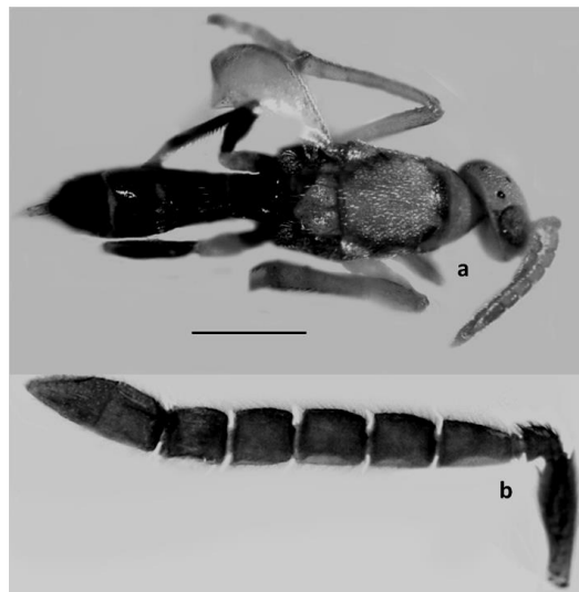
Figure 2. Neanastatus misirensis n. sp. Male. a. body, in dorsal view; b. antenna. Scale bar for a= 0.5 mm; for b= 0.25 mm.